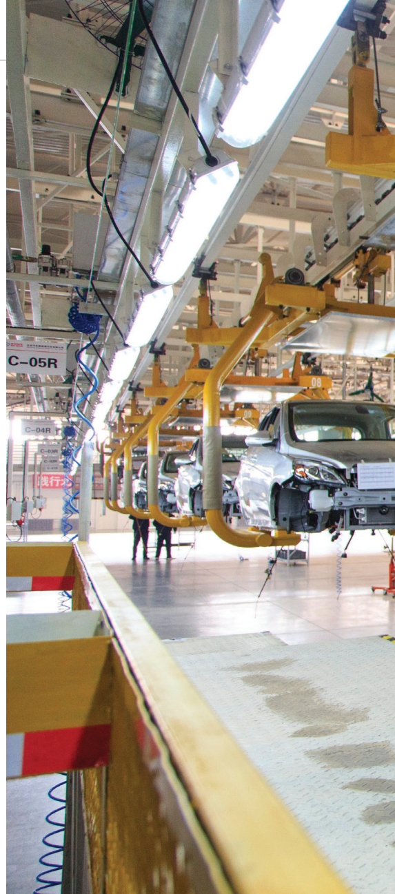
A worker at the EV development center of the Beijing Automotive Group, which was created with Beijing government support.

China's ambitious goal-setting has happened amid doubts about the EV sector's prospects for scaling up internationally. Toyota, for example, recently delayed the launch of its electric vehicle, eQ, citing misjudgment of demand in the pure EV market coupled with continuing difficulties in improving battery technology. Switching a country or a region to a new generation of environmental technologies like electric vehicles requires the coordination of many actors—car manufacturers, battery developers, charging infrastructure providers, governments, and consumers. Such a challenge is likely too great for any private company—even one as large and path-breaking as Toyota—to accomplish on